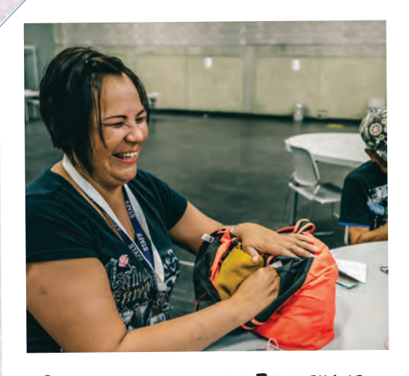
PASSING TIME, MAKING INDIGENOUS ARTS AND CRAFTS AT THE EXPO!