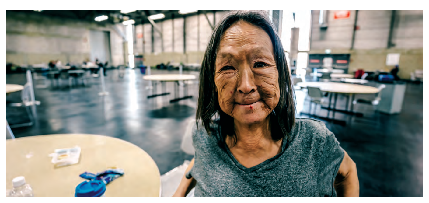
Thanks to donors like you, the Expo Centre served an average of 650 people per day!